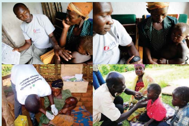
Community health workers assess for malaria, pneumonia and diarrhoea

1.Karolinska Institutet, Department of Public Health Sciences 2.Malaria Consortium Uganda 3.Malaria Consortium 4.Makerere School of Public Health