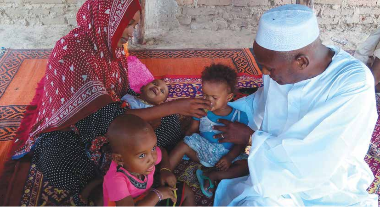
A community health worker administers the first dose of SMC, Chad