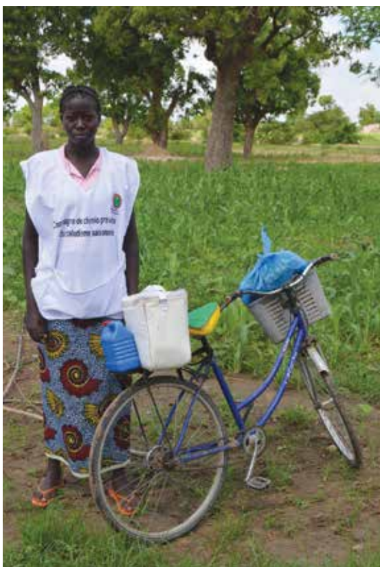
Community health worker distributes SMC in Boulsa, Burkina Faso