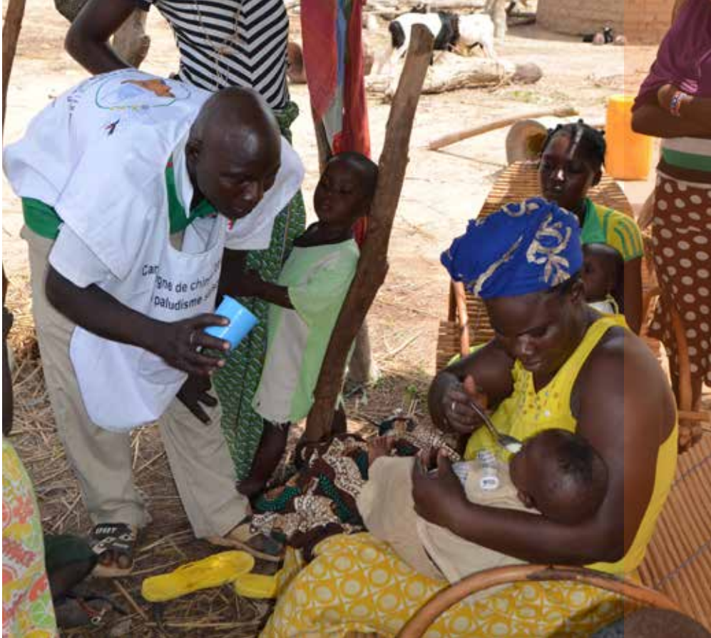
► A community health worker administers seasonal malaria chemoprevention during an ACCESS-SMC distribution in Boulsa, Burkina Faso