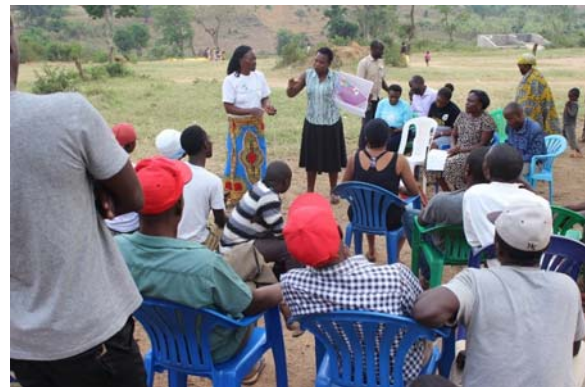
A community dialogue in Rwamwnaja recommended by Fort Portal RRH team to support Kamwenge District in January 2018

USAID's Malaria Action for Districts project has been working with the Ministry of Health in Uganda to strengthen the capacity of regional referral hospitals, improve the quality of their services and improve the provision of technical supervision to districts. As a result, at Fort Portal Regional Referral Hospital, malaria related deaths have dropped significantly.