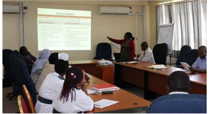
A doctor from the National Malaria Control Program (NMCP) gives Malaria updates during the feedback meeting at Fort Portal RRH

MAPD plans to engage directly with communities through interventions that Malaria Consortium has successfully used (such as integrated community case management and interpersonal communication) and encourage support between districts, health facilities and communities in order to reduce malaria mortality in Uganda.