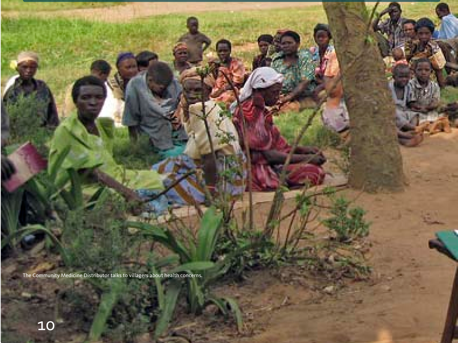
The Community Medicine Distributor talks to villagers about health concerns.

We have a network of 20 offices in Africa that provide technical support and direct implementation of interventions. We work in a range of settings but our focus is very much on high burden countries irrespective of how challenging the implementation environment is.