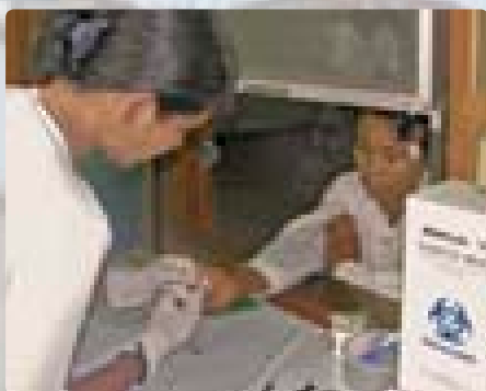
Photos from left: Early diagnosis and treatment is offered through malaria clinics; A patient is interviewed with the help of a translator.

Since its inception Malaria Consortium has always maintained engagement with malaria control in Asia. This engagement grew out of long-term collaborations with the region, together with a commitment to working on the particular challenges faced in Asia. One such challenge lies in organising malaria control programmes in contexts where malaria is declining from its earlier position of major health burden, with the consequent need to decentralise and integrate malaria activities with other health programme priorities. Strong information and monitoring are needed to deal with a disease that is in decline but could re-emerge at any time.