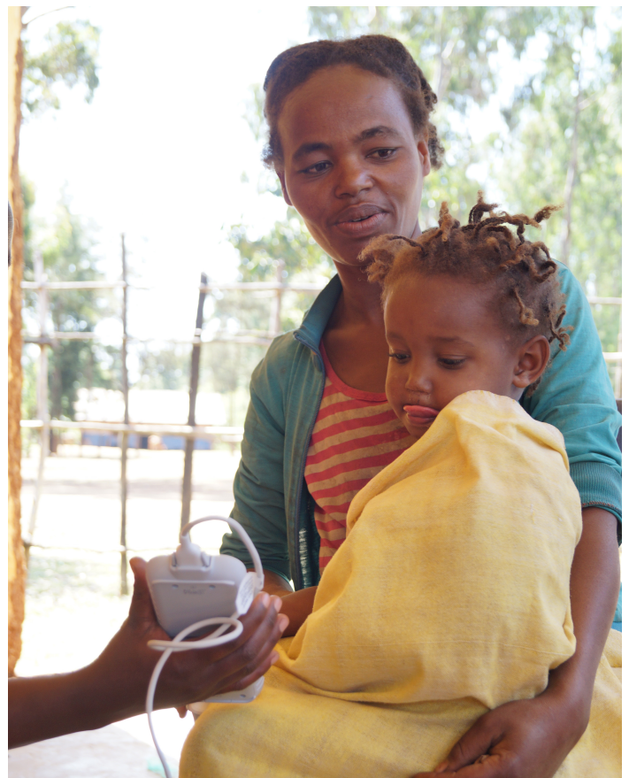
A child is tested for pneumonia with a respiratory monitoring device, Ethiopia

Our research is part of the global effort to close current knowledge gaps relating to the prevention, diagnosis and treatment of pneumonia. We chair the research group of the Every Breath Counts Coalition, which aims to end preventable child pneumonia deaths by 2030. In partnership with key international stakeholders, the coalition has recently published global research priorities for pneumonia and seeks to focus the pneumonia response on 10 countries that account for 60 percent of pneumonia deaths. [14]