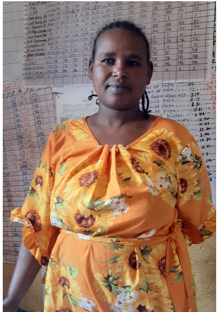
HEW based at Shayamba kilena health post, Damot Sore

data embedded HEWs in annual district-based microplanning for malaria commodities throughout the project, such as insecticide-treated nets, rapid diagnostic tests and medications.