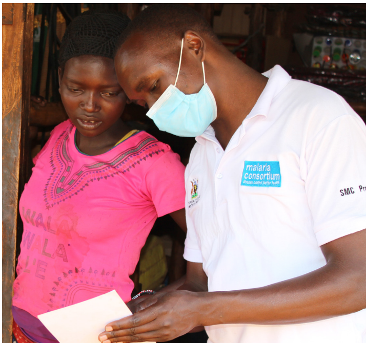
During the delivery of SMC, each caregiver is provided with a child health card completed with the child's name, village, VHT member's name and details of each SMC cycle

Further reading: bit.ly/JErXuL and bit.ly/2PqtL0z