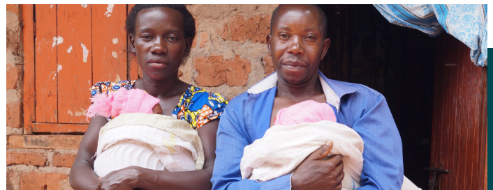
Parents practising kangaroo care as part of the iCCM-MaCS project

We have supported the implementation of malaria and child health programmes in over 95 percent of districts in Uganda. We facilitate integrated care plans and training to prevent and treat childhood illnesses, including through surveillance and mass immunisation.