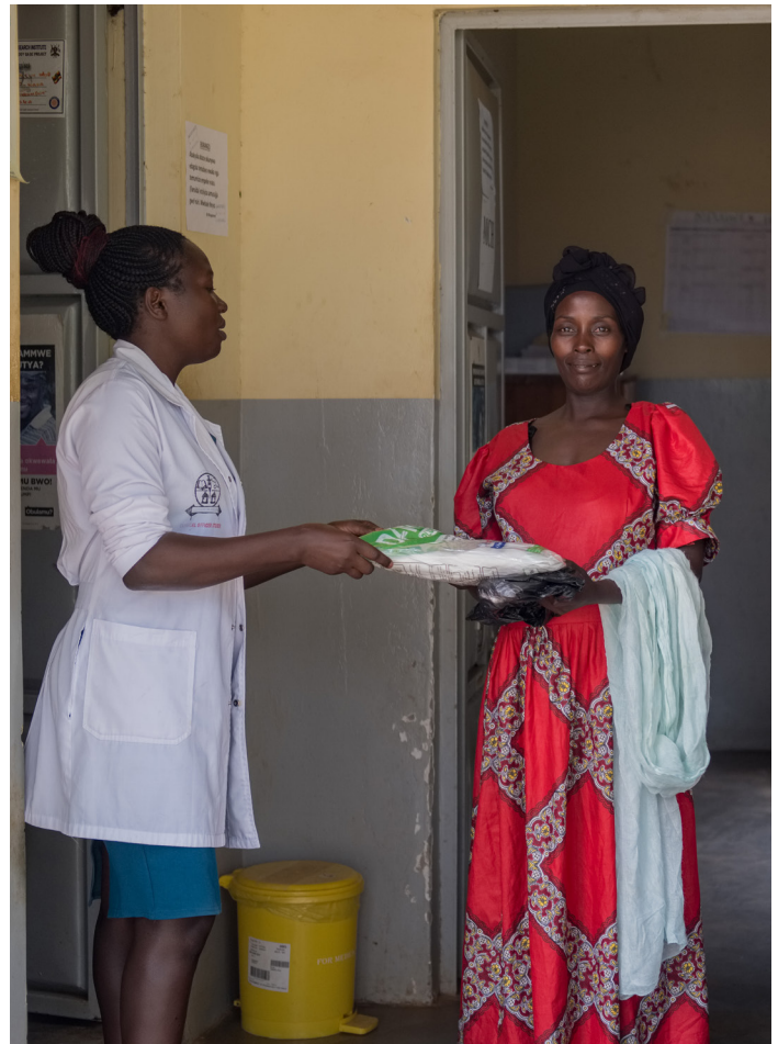
Expectant mother receiving a bed net at Mpugwe Health Centre III, in Masaka district