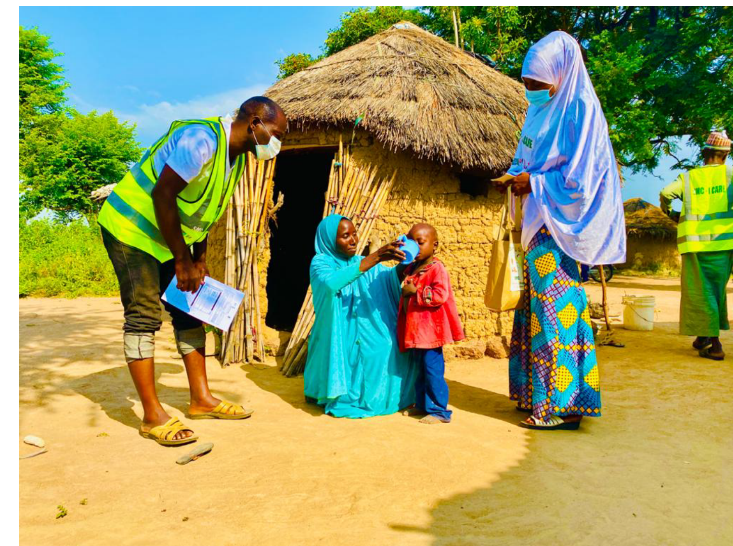
A caregiver administers SPAQ to her child, supervised by community distributors, Tafawa Balewa local government area, Bauchi state, Nigeria