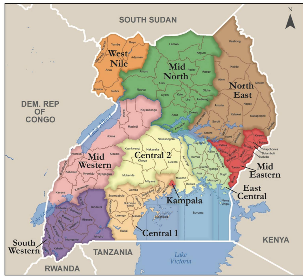
Figure 1. Map of Uganda<sup>11</sup>

Uganda is located in the East African region of sub-Saharan Africa, and lies across the equator, about 800 kilometers inland from the Indian Ocean. The country is landlocked, bordered by Kenya in the east; South Sudan in the north; Democratic Republic of Congo in the west; Tanzania in the south; and Rwanda in the southwest. Uganda has a total population of 34.9 million people with an annual increase rate of 3 percent. Uganda has one of the youngest populations in the world with 68.5 percent (70.1 percent male, 67 percent female) less than 25 years of age.9 Adolescents (10-19 years) compose 25.6 percent (26.2 percent male, 25.1 percent female) of the population.<sup>10</sup>