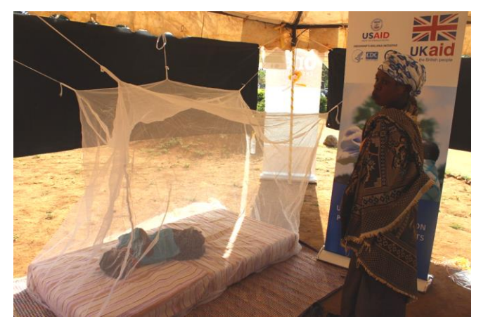
Demonstrating the appropriate use of mosquito nets

USAID's Malaria Action Program for Districts has successfully supported Uganda in its fight against malaria. This is demonstrated in the reduction of malaria cases and deaths that have occurred in its districts over the project term. All districts in Masaka region, central Uganda are, for the first time reporting that malaria has fallen to become the second highest contributor to its outpatient department health issues, rather than the highest.