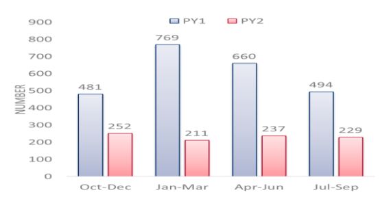
Figure 2: Malaria-related mortality in MAPD districts during years 1 and 2

USAID's Malaria Action Program for Districts is working at all levels – national, district, health facility and community to promote sustained reduction in malaria burden throughout the country. As seen in the figures 1+2, malaria cases and deaths are reducing in all of MAPD's 49 districts.