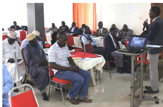
Photo: MAPD working with religious leaders to fight malaria

USAID's Malaria Action Program for Districts works together with religious leaders to develop sermon guides about malaria and health, so these influential leaders can drive positive malaria change among their followers – a novel approach in Uganda.