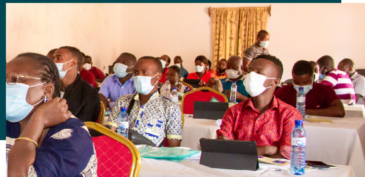
iMISS Training in Lichinga, Niassa province

This cutting-edge intervention will better inform drug and diagnostic choices. With the help of transmission network models, the project monitors drug and diagnostic resistance and helps target the reservoirs sustaining transmission in near-elimination settings. Genomic surveillance will also supplement traditional surveillance by measuring genetic diversity within Plasmodium falciparum parasites to understand importation of malaria in low transmission settings and inform transmission dynamics in medium to high transmission areas. The project will further help us to understand how different intervention mixes affect transmission and resistance, and help inform how best to tailor context-specific interventions locally and nationally. We will use antenatal care clinics as a sentinel population to better understand how malaria dynamics in pregnant women reflect the realities among the general population.