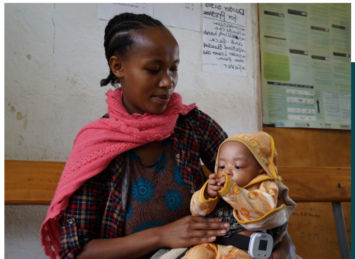
Caregiver holds child wearing a ChARM device — a respiratory rate counter used to monitor breathing in the Acute Respiratory Infection Diagnostic Aid project.

Our pioneering research projects can only be achieved thanks to the vital contributions of our many partners, including the Ethiopian Public Health Institute, Johns Hopkins University, John Snow Inc., Karolinska Institutet, the Nuffield Centre for International Health Development at the University of Leeds, Oulu University, Pathfinder International, VTT Technical Research Centre of Finland and WHO.