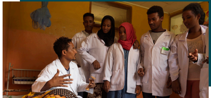
Healthcare workers being trained in maternal care.

To better treat severe malaria in Oromia and the SNNPR, we worked with government partners to improve access to injectable artesunate, which is used to treat severe cases and has a much higher survival rate than the alternative therapy of injectable quinine. Through coordinated interventions, we addressed key barriers to supply and demand, and trained health workers on severe malaria case management.