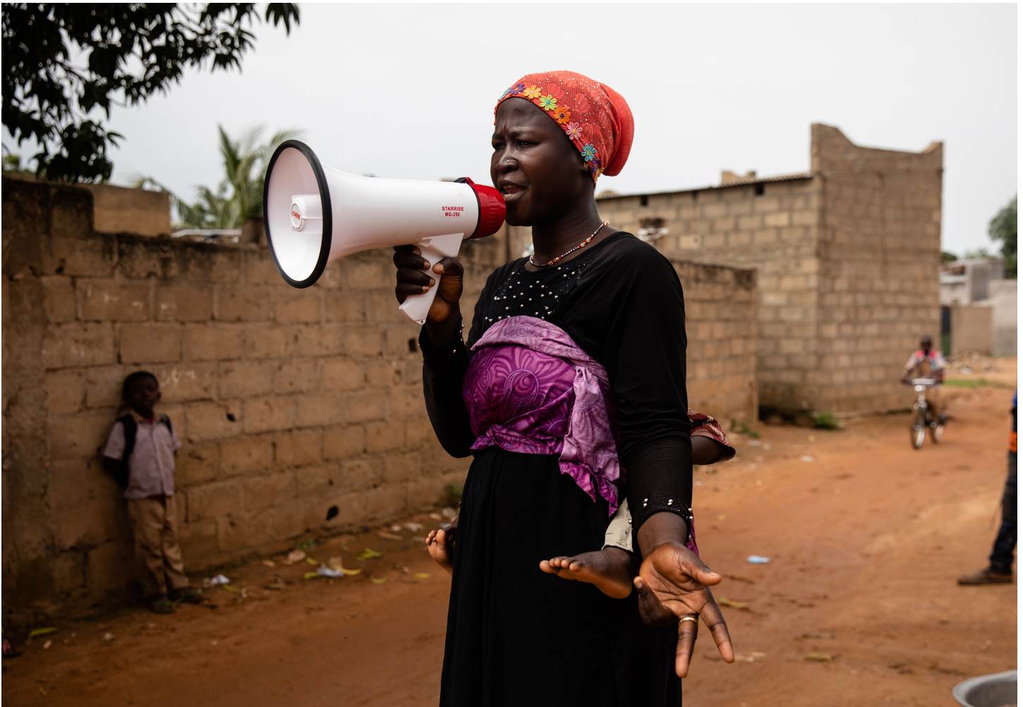
Town crier spreading information about SMC, Burkina Faso