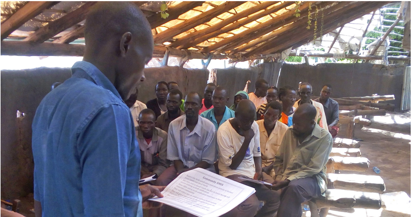
Community-based distributors receiving training during the pilot