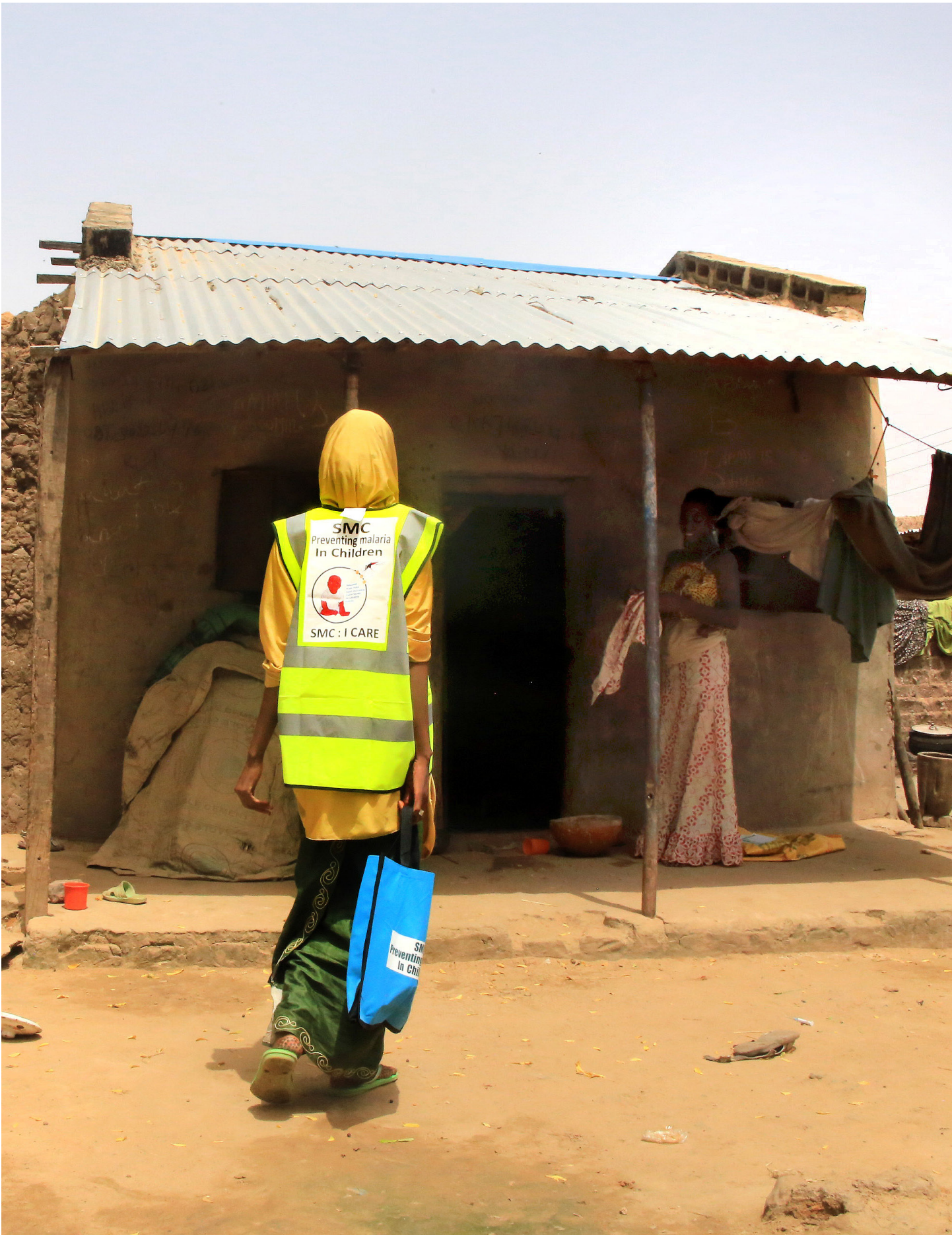
A mother welcomes a CD into her home to treat her children with SMC during the 2019 campaign, Nigeria.