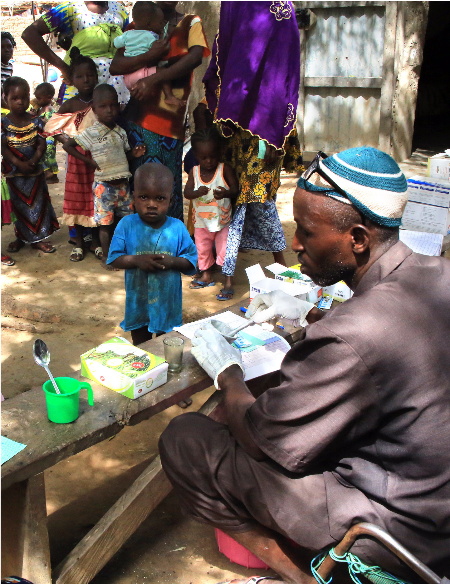
CD showing caregivers how to prepare SMC medication for their children, Nigeria.