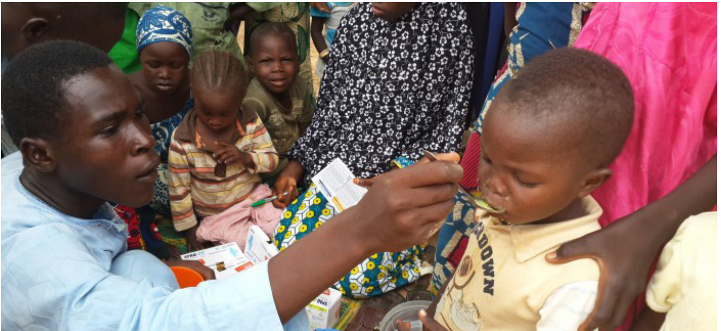
CD giving the first dose of life-saving SMC medication to a young boy, Nigeria