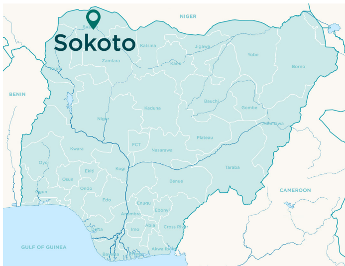
Map of Nigeria showing the location of Sokoto state

The pilot implementation study used mixed methods, with qualitative focus group discussions and key informant interviews, and quantitative components (baseline and endline comparisons of VAS and SMC coverage).