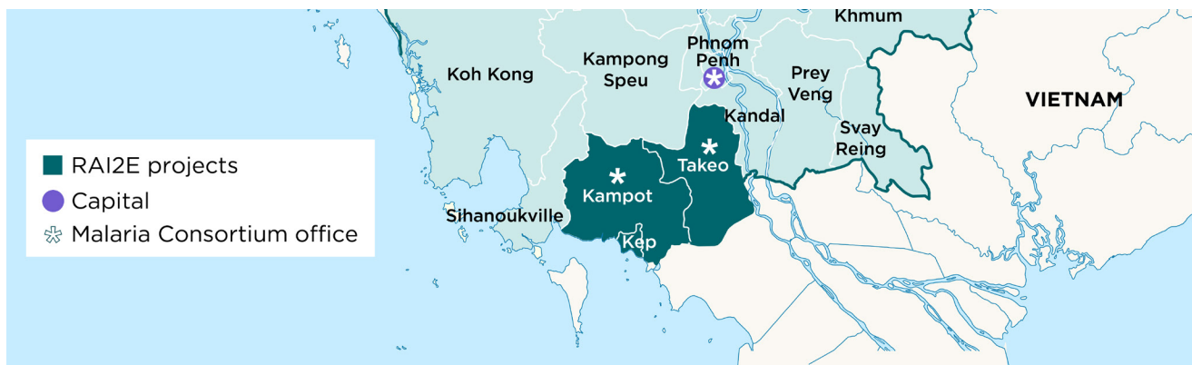
Figure 1: Locations of RAI2E projects in southern Cambodia