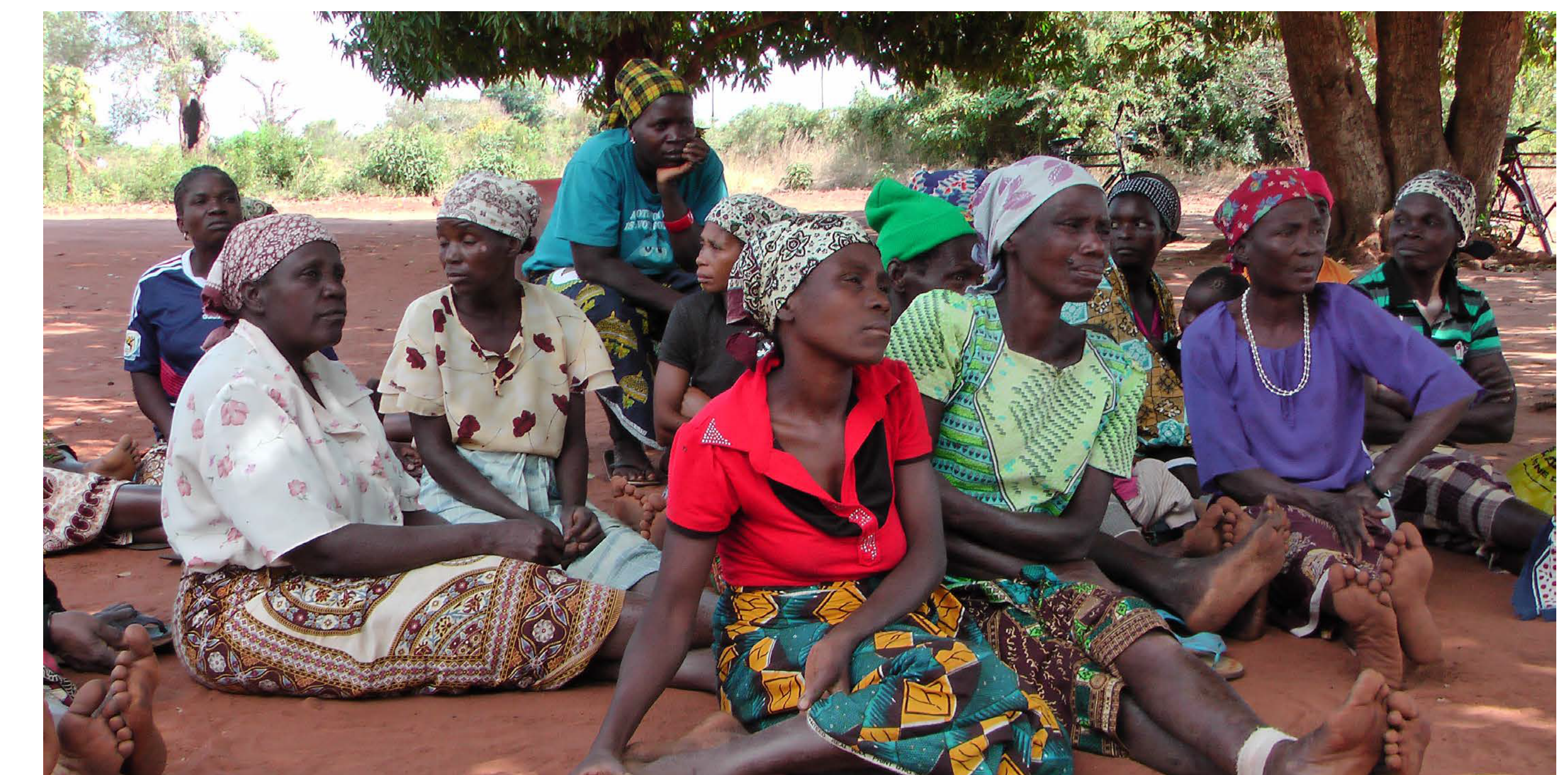
Community members participating in a dialogue session in Mozambique