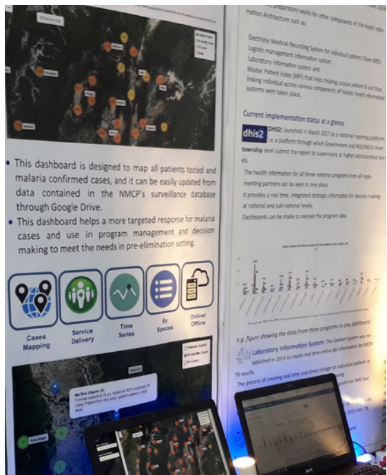
Training NMCP staff in surveillance, monitoring and evaluation, and use of data