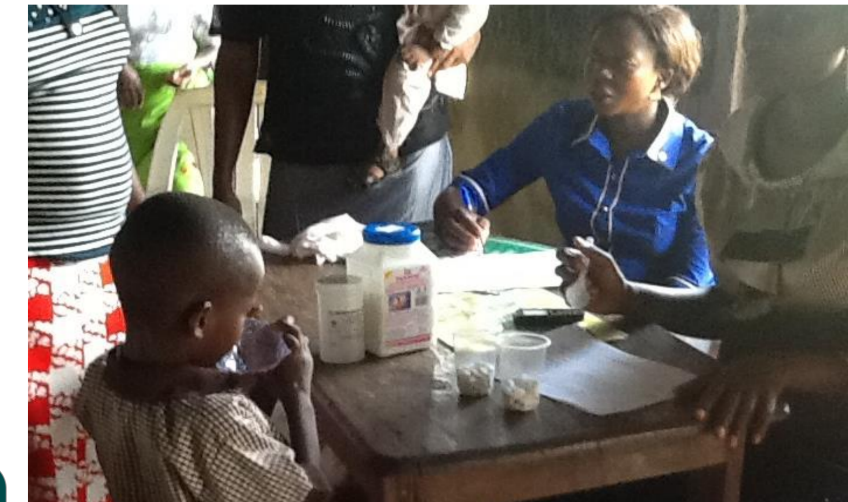
Teachers administering drugs to a pupil