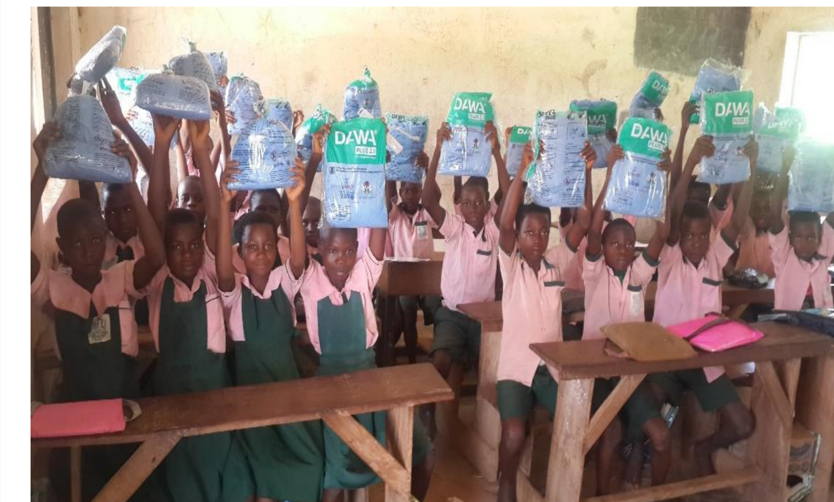
Pupils receiving LLINs