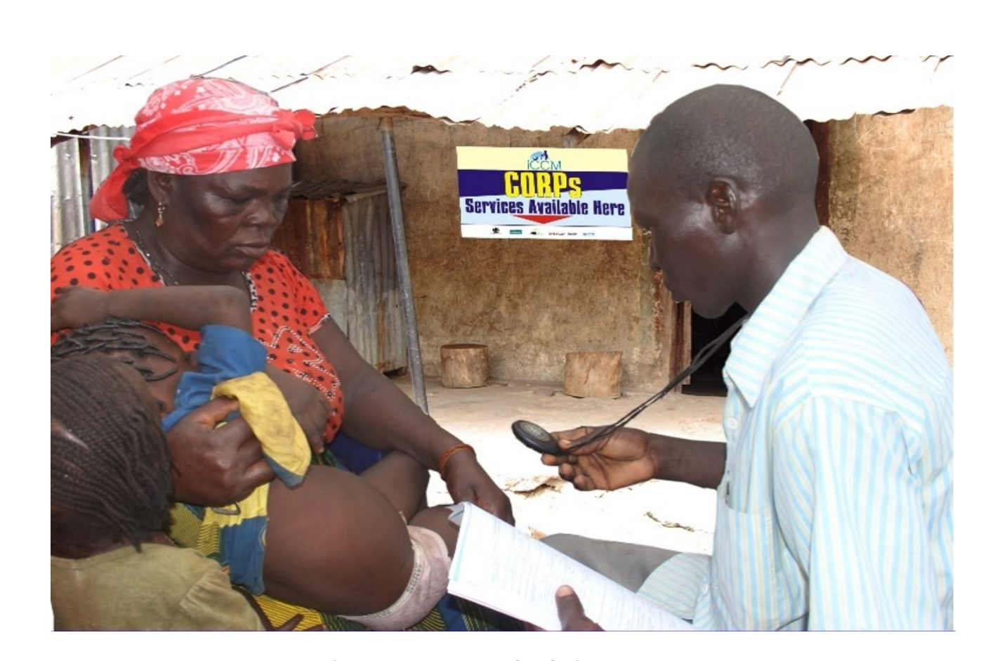
A CORP attending to a child