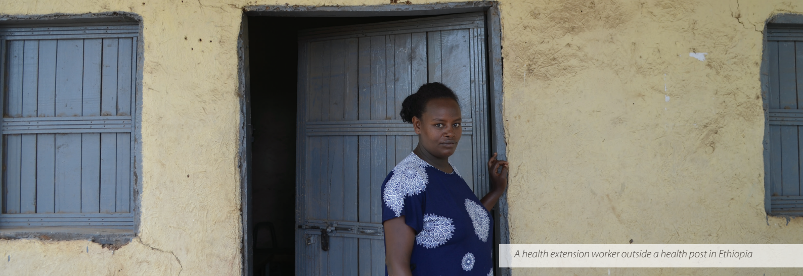
A health extension worker outside a health post in Ethiopia