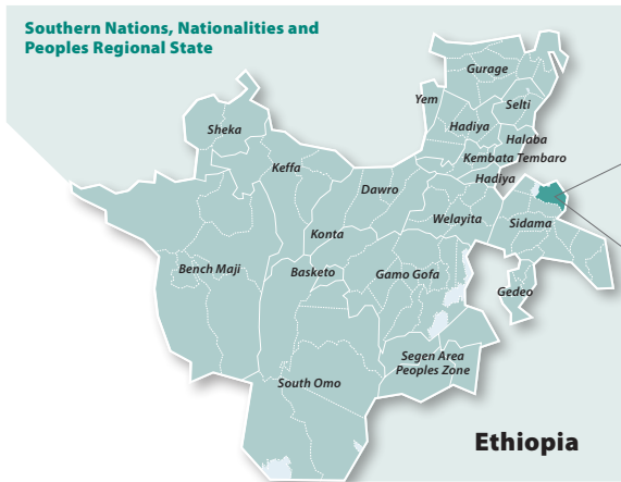
Hawassa City Administration