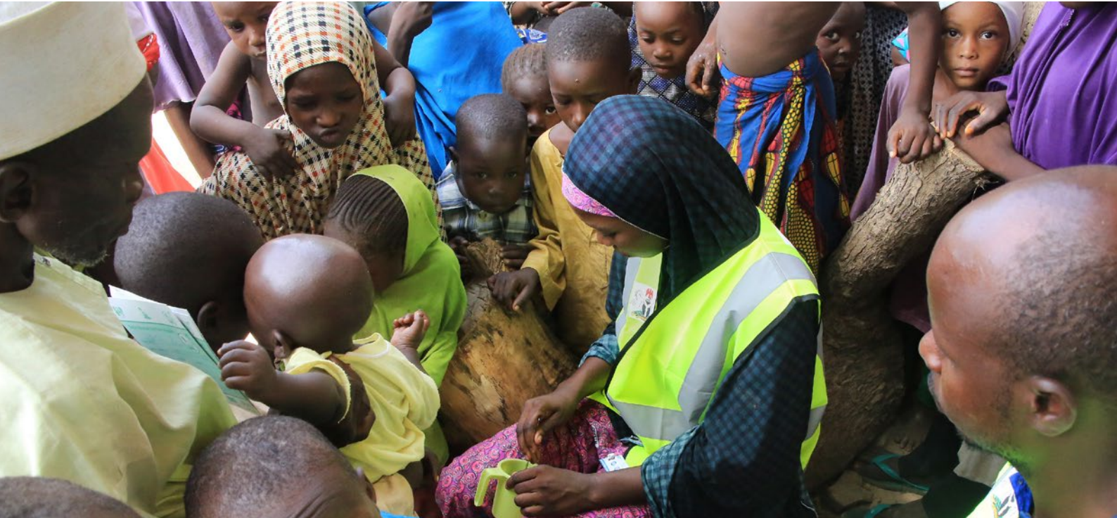
Community health workers administering the first dose of SMC and recording data

Achieving catalytic expansion of seasonal malaria chemoprevention in the Sahel