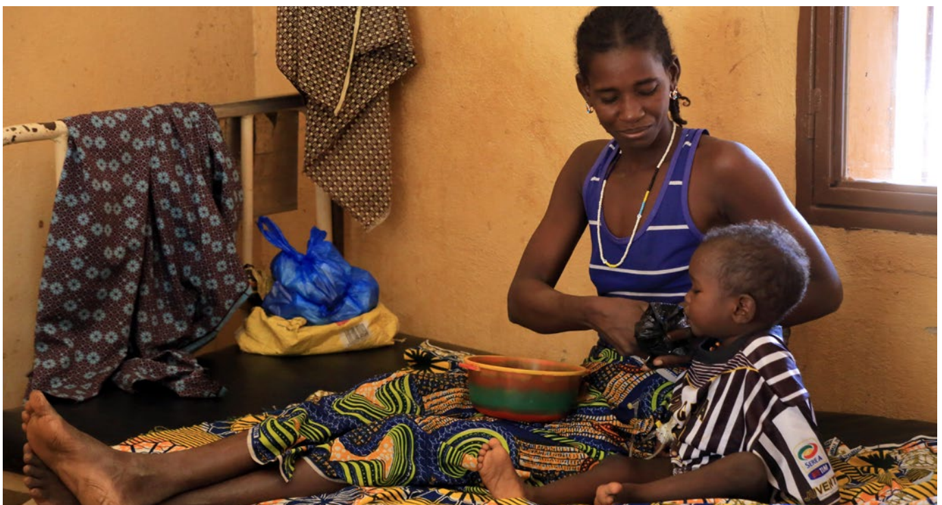
Caregivers administer SMC doses at home on the second and third days

To contribute to the reduction of malaria during the rainy season in the Sahel, ACCESS-SMC aimed to increase global interest and capacity among manufacturers for quality-assured SMC products, efficiently procure and administer SP+AQ treatments, demonstrate the safety and effectiveness of SMC delivered at scale, and create sustainable demand for SMC by engaging stakeholders to advocate for the resources to improve access to SMC.