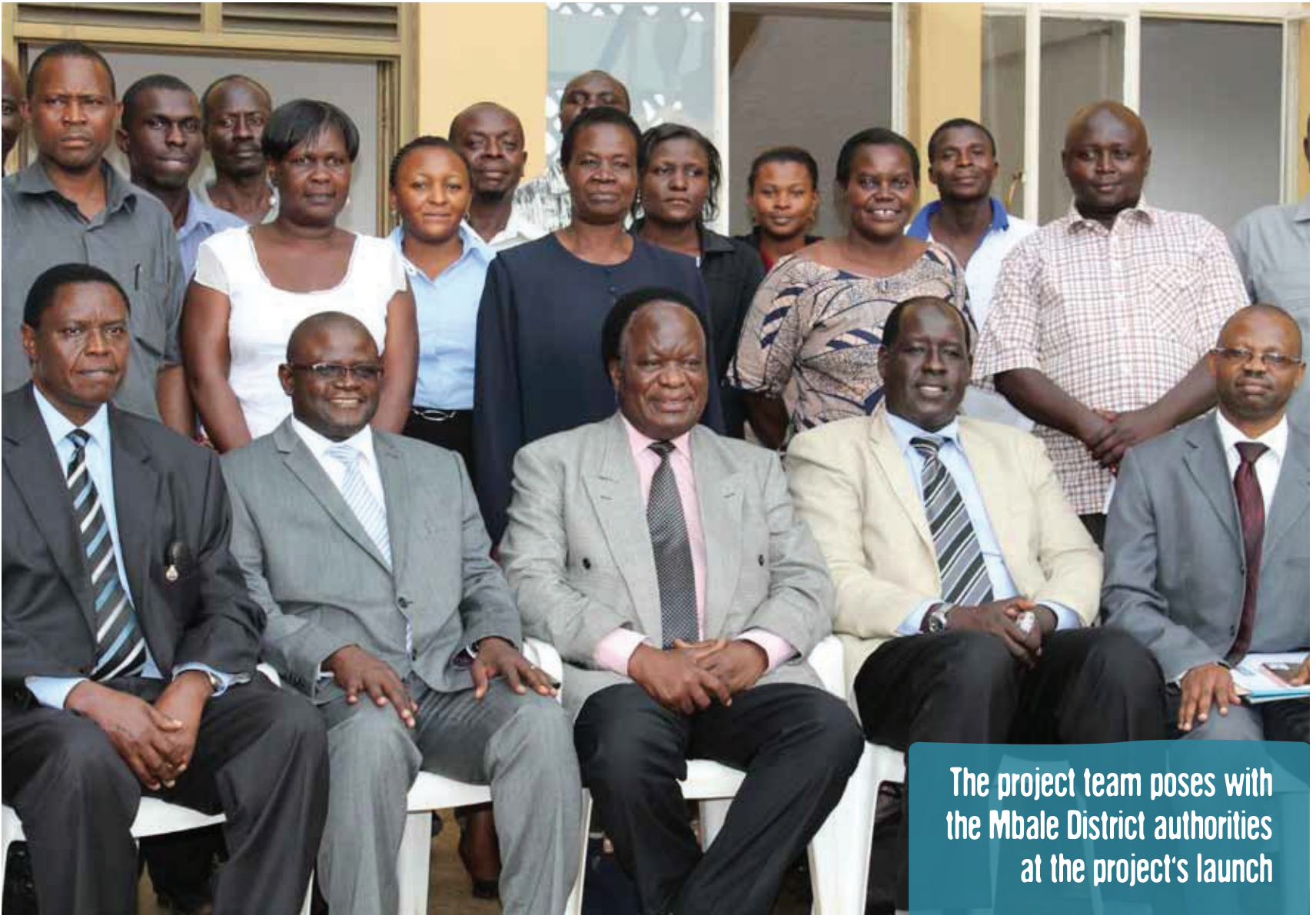
The project team poses with the Mbale District authorities at the project's launch