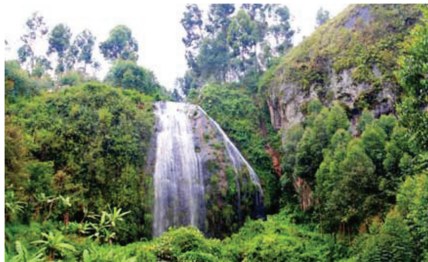
Wanale, one of the most remote and hard to reach sub-county in the district

Thanks to the intervention of the VHTs, the whole community has sympathised with these children and provided them with food and clothes. Fatinah continues to monitor the four children closely; they visit the health centre for regular checkups and their health has improved. “I wanted to help the community. As I am now a VHT, people respect me.”