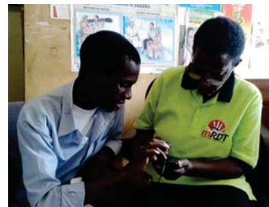
Hands on training session during follow up visit