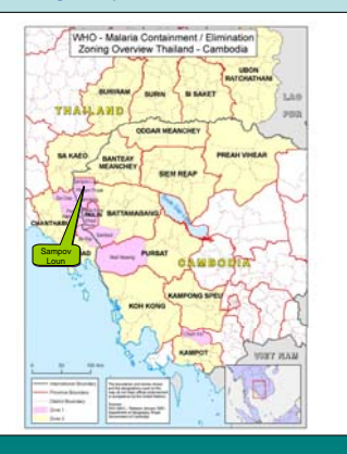
Fig 1, Map of Containment Zones