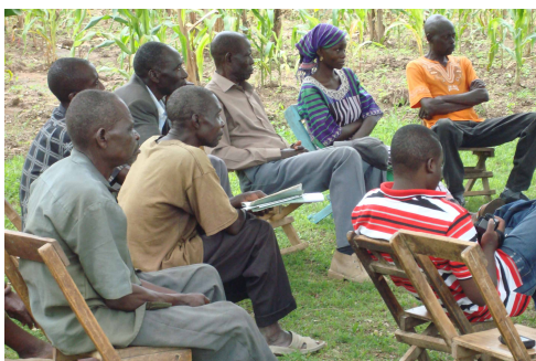
Village health clubs help identify health challenges

Based on the formative research, the community intervention has taken the form of the village health clubs in Malaria Consortium ICCM implementation districts in Uganda.