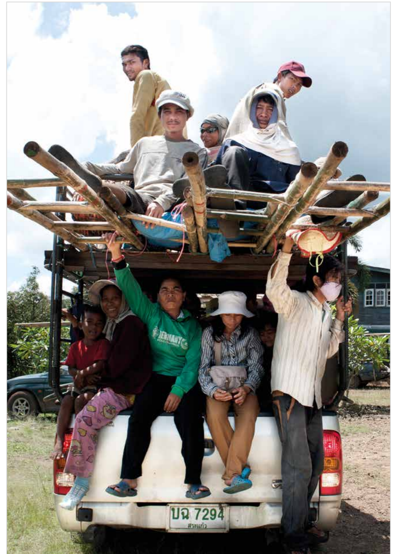
Cambodian migrant workers in Thailand taking part in an antimalarial drug resistance study