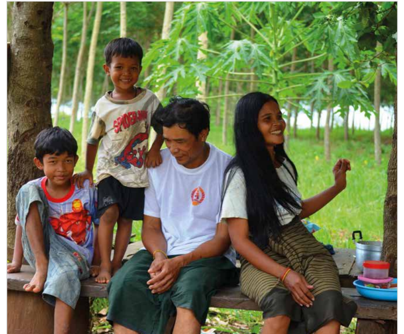
Migrant and mobile populations, such as this family working in a plantation in Pailin, Cambodia, are most at risk of malaria

As we move forward from the MDGs and begin work towards achieving the SDGs, sustained political will for combating malaria is crucial. MDG 6(c), which called on the international community to halt and then reverse malaria rates by 2015, provided the impetus for a large mobilisation of resources and political will. However, with 17 goals covering a broader range of areas of development, the SDGs do not include such a strong focus on malaria. There is a risk, therefore, of losing the momentum of the past 15 years and the substantial progress made in tackling the disease. This is despite the significant impact that reducing malaria will have on a wide number of the SDGs; from reducing poverty, tackling hunger and increasing school attendance, to boosting economic growth, supporting gender equality and tackling climate change. 5 It is therefore important that political advocates continue to press for investment in malaria elimination.