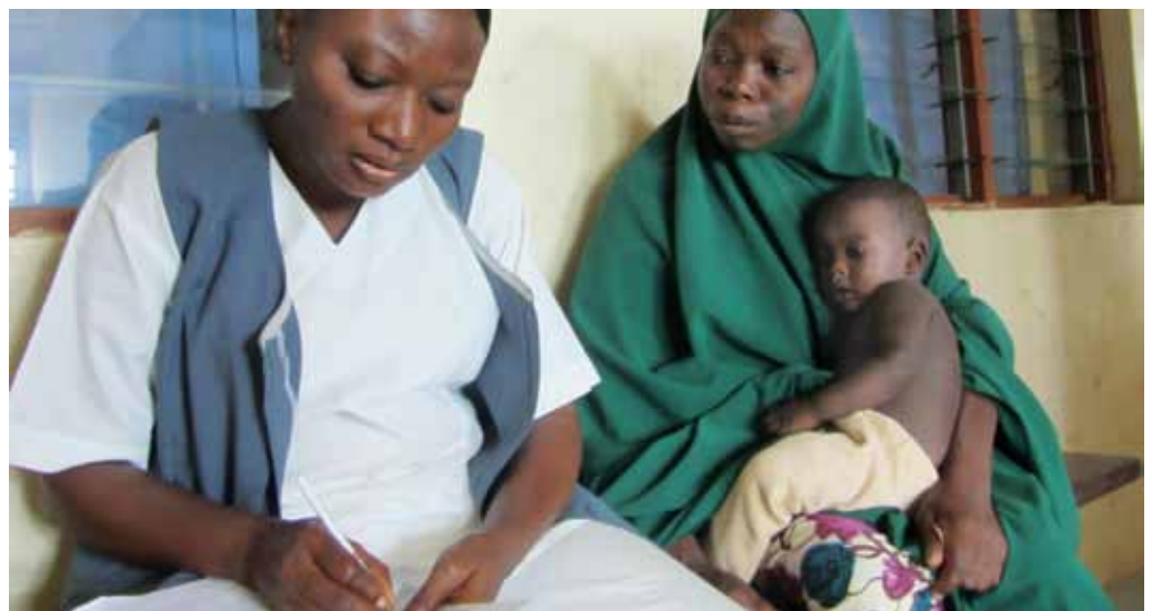
Hospital staff are trained under SuNMaP’s capacity building work to help them treat malaria more effectively

SuNMaP decided to adopt a people-centred, pragmatic and focused approach that goes beyond training to improve the knowledge, skills and practices of programme managers and health care providers. It strengthens organisational capacity to implement effective and sustained malaria control within the health system. Further information on how this works in practice appears throughout this learning paper.