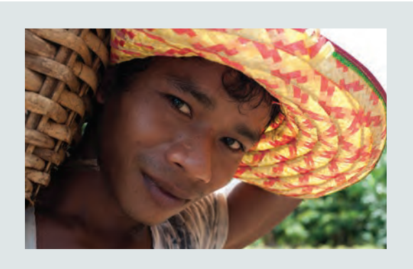
A clear, well captured shot of a subject looking directly at the camera.

A portrait is a close-up photograph of an individual. This is an essential element if you are interviewing someone and they are the main subject of your story. The photograph should ideally only feature this person (unless it includes an additional person who is especially relevant, such as a child) and it should be reasonably close up. It is helpful to have this photograph taken in a relevant environment. For example, a health worker could be at a community centre or sat at a table with medication around them. While it is good to have them engage with the viewer, sometimes this can make the individual too self-conscious. A more natural shot would have the subject looking at something or someone, or with the subject looking slightly to one side of the camera.