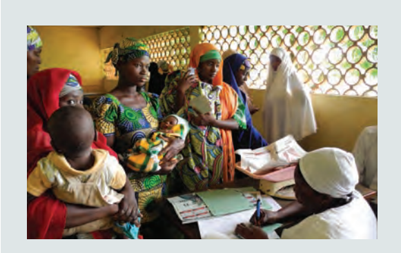
Mothers attending a weekly immunisation clinic conveys how the right level of health care and support is a priority for mothers with newborn children.

Activity shots help to illustrate what actually happens during the life of a project. Relevant activity shots might be a health worker giving a talk in a community, a mother hanging a mosquito net, a health worker receiving training, a CHW carrying out an RDT, or queues of people waiting for nets or for treatment.