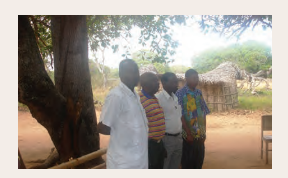
There is little happening, no action or context, and the position of the photographer is poor, casting all the faces in shadow.